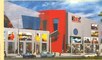
EF3 Shopping Mall, Faridabad