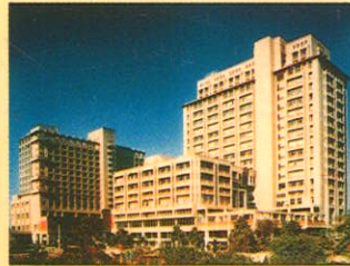
International Trade Tower, Nehru Place