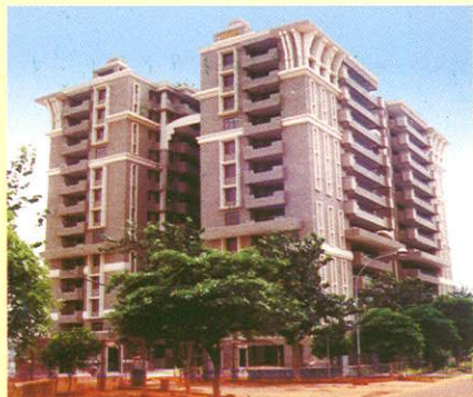
Royale Retreat, Charmwood Village

Charmwood Village, on Suraj Kund Road in continuation of posh New Delhi colonies, is fast developing as the finest residential township. For reasons that become obvious to even a cursory visitor to the complex.