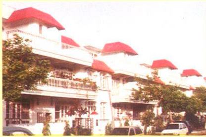
Villas in Eros Garden