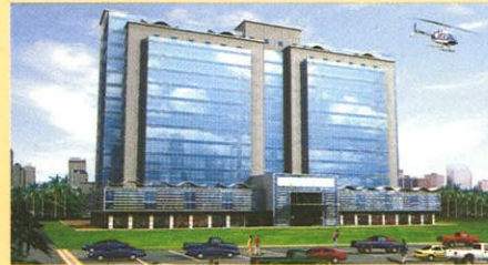
Eros Corporate Park, IMT- Manesar, Gurgaon