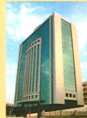
Eros Corporate Tower Nehru Place, New Delhi