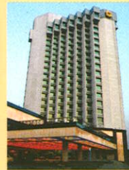
Hotel Shangri-La New Delhi