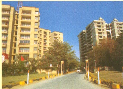
Entrance to Charmwood Village