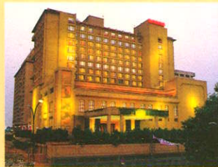
Intercontinental Eros, Nehru Place, New Delhi