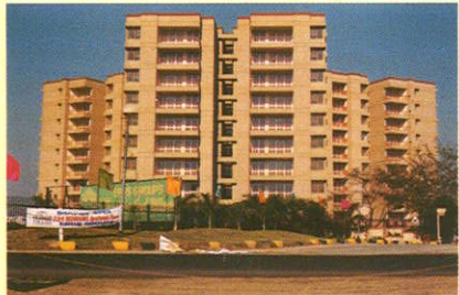
Belvedere Tower, Charmwood Village